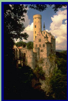
UNION SPRINGS ACADEMY: EDUCATING YOUTH FOR HIS NEW KINGDOM