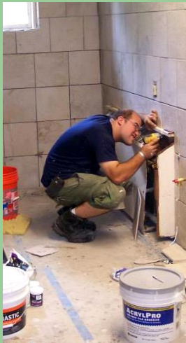
PHOTO TAKEN DURING 2015 USA RENOVATIONS WEEK

"UNION SPRINGS ACADEMY IS WHERE I MET MY SPOUSE, SO THEREFORE I BLAME YOU ALL!"