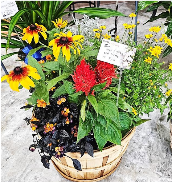
Your friends and family at Hydro