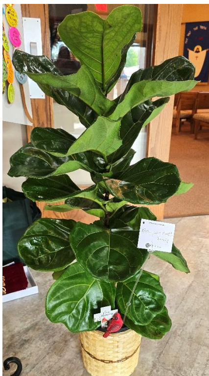
Your MOCC Family