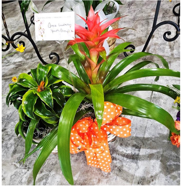
Grace Lutheran Youth Group