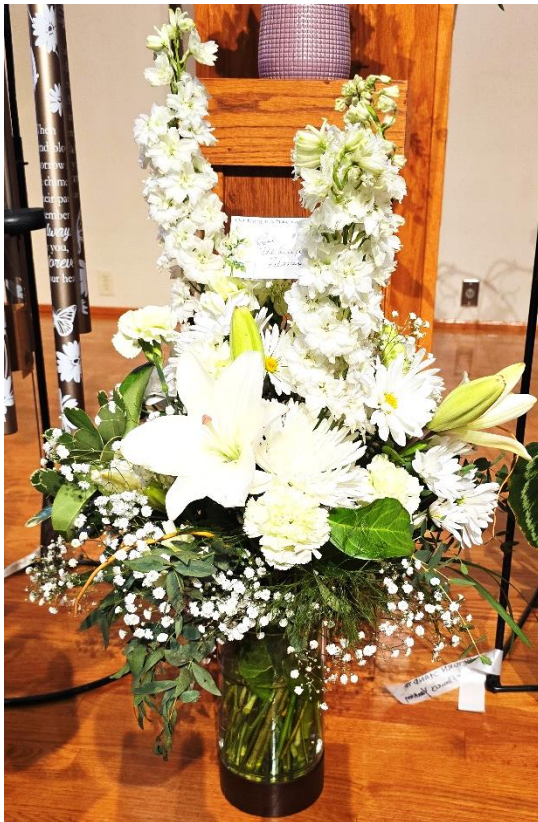
Love, The Grode Family