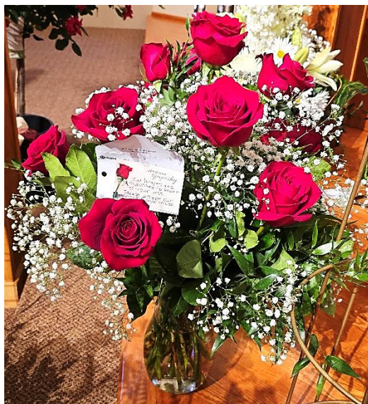
Our hearts are saddened to learn of your loss. Please accept our warmest condolences. Citi