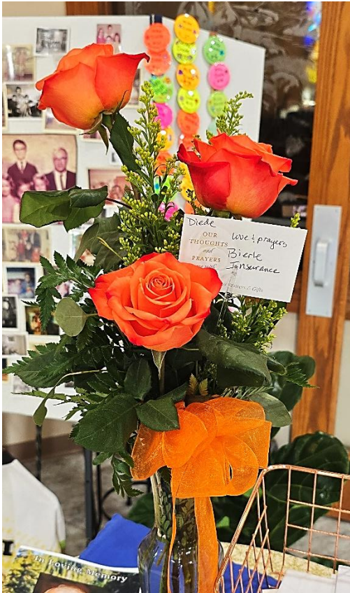
Love & prayers. Bierle Insurance