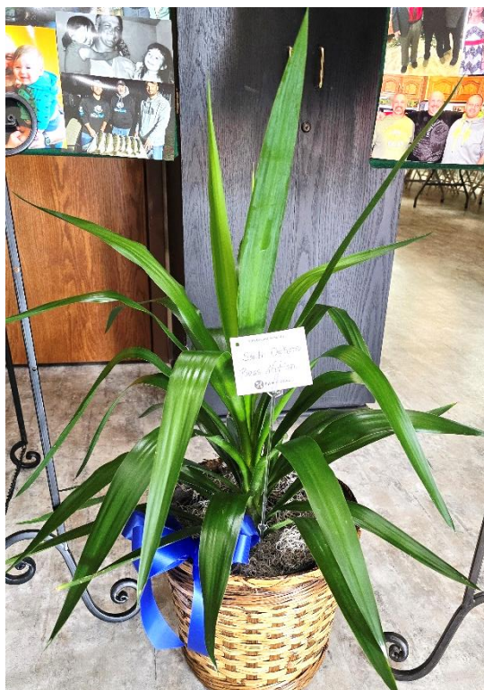
South Dakota Bass Nation