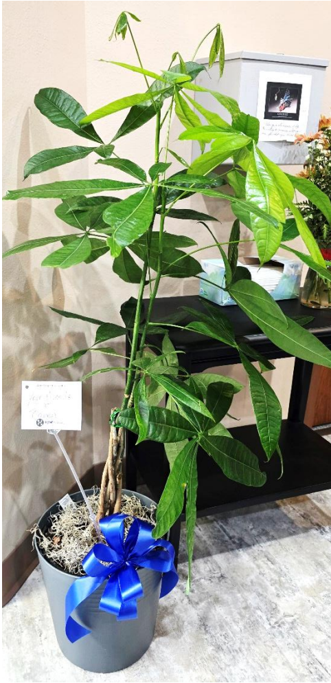
Your friends at Raven