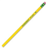
No. 2 Pencil Quantity: 1 box Just for end of year exams