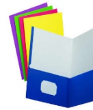
Pocket Folder Quantity: 10 Folders w. pockets