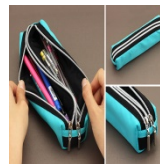
Pens/Pencils Container With Zipper