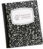
Composition Notebook Quantity: 8 Marble Composition Books