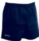
Blue Shorts School Logo or Plain