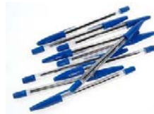
Pens red/black/ blue ink ball pens