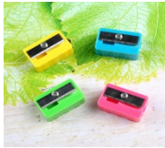
Sharpener Quantity: 1 box 1 sharpener no electrical