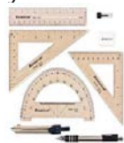
Geometry Set Quantity: 1 set Clear plastic tools