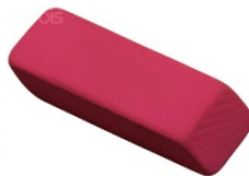
Erasers Quantity: 2