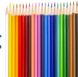
Colores Pencil Quantity: 1 Pack