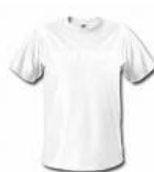
White T-shirt School Logo or Plain