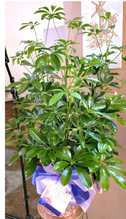
Scotland GSS Staff & Neighbors