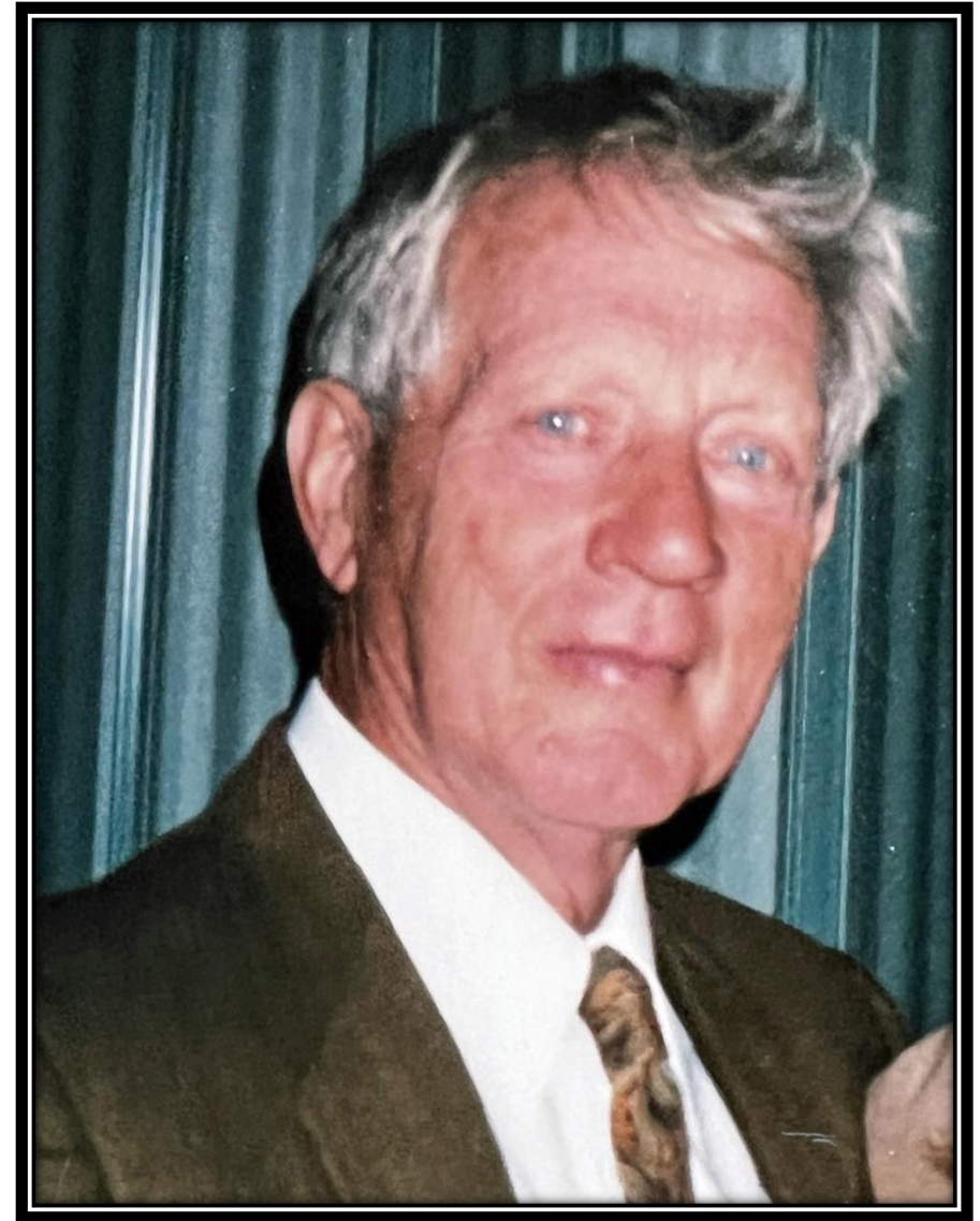
Gordon Lee Hall