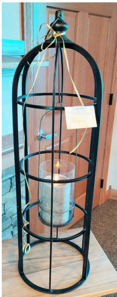
Our love & prayers. Heine Farms Feedyards