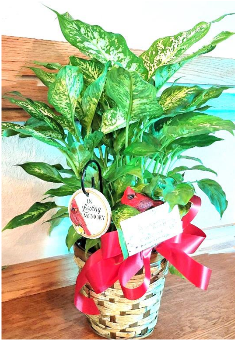
Augustana Academy Class of '68