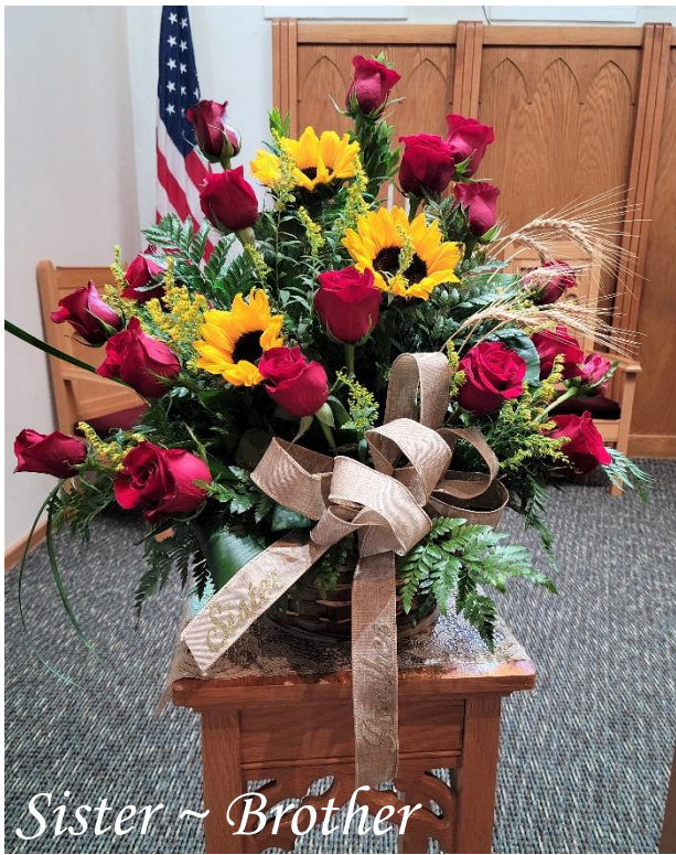
Sister ~ Brother