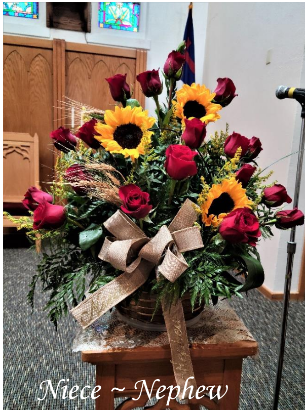
Niece ~ Nephew