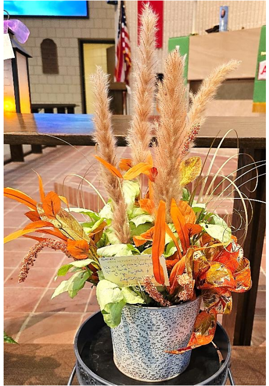
We are so very sorry for your loss. Cory Kofoid & Lynsay Wek