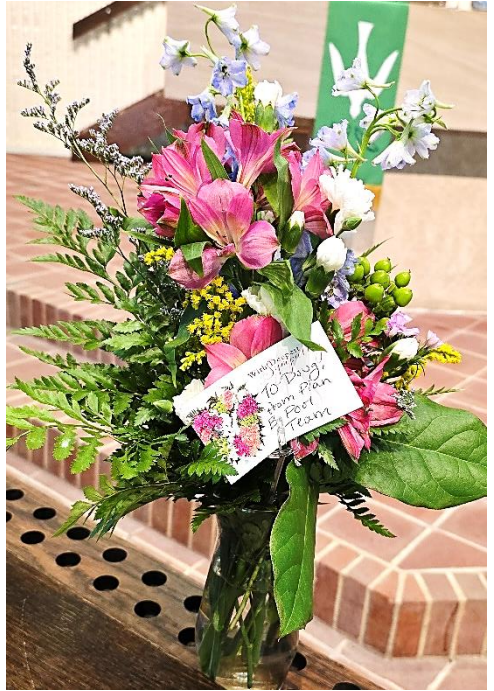
To Doug, from Plan B Pool Team