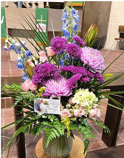
Your FNBO Family