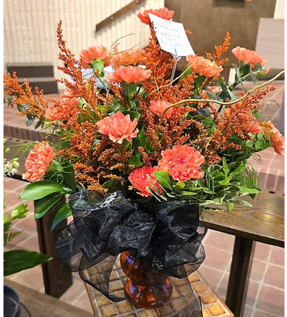
Tyndall High School Class of 1976