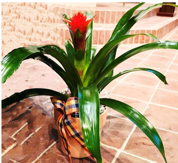
Class of 1993