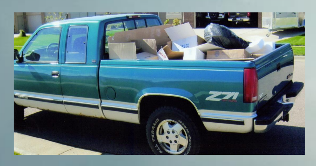
Kevín's truck, always ready.