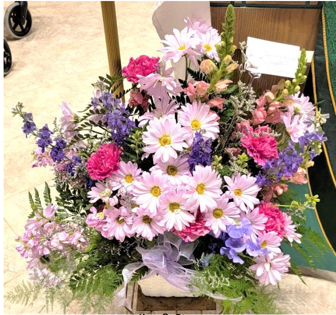
Jim & Starr Crystal & Family