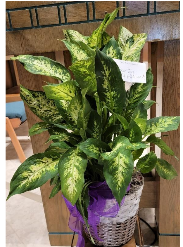
Tripp Fire Department