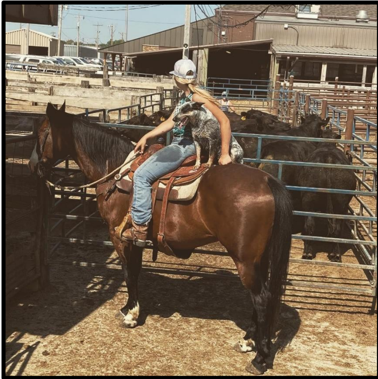
Brooklyn and Sage working cattle