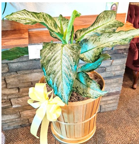
Thinking of you with deep sympathy Shur-Co