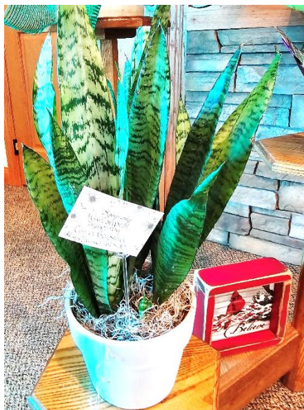
With deepest sympathy City of Beresford Mayor, Council and Staff