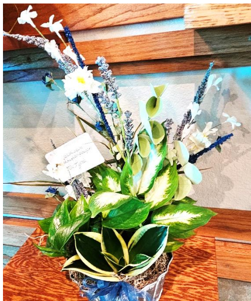
With warm thoughts and prayers The Lyons