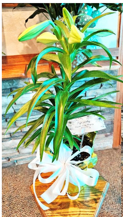
The Zoss Family