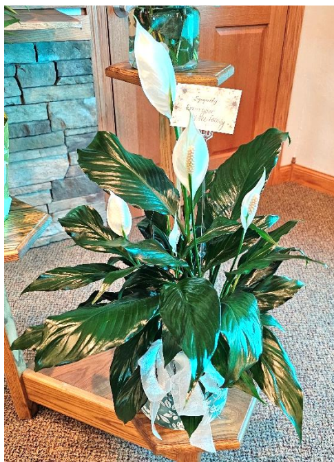
Your Hy-Vee Family