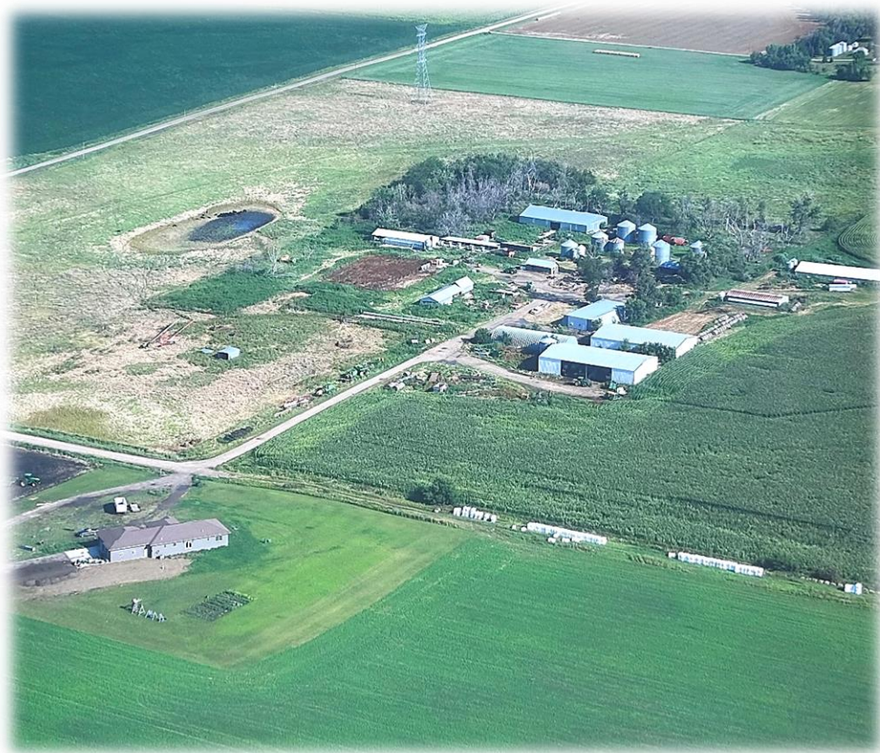
Bauder Farm 2014