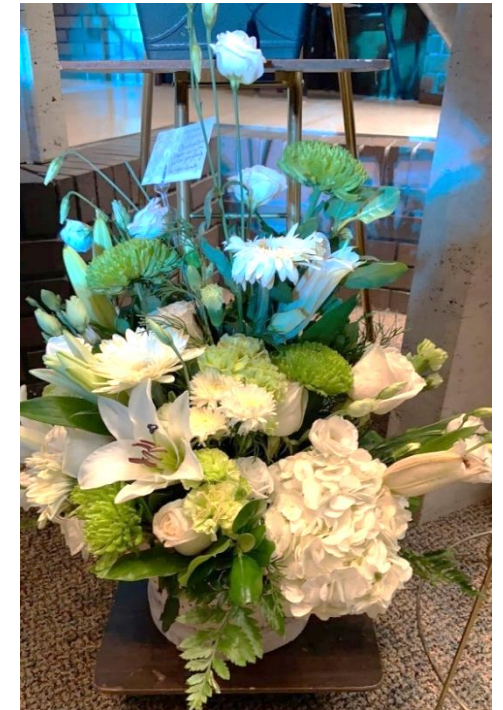
Your Yoga Family