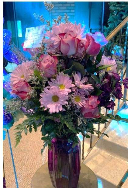
Tyson & Dwain Owens