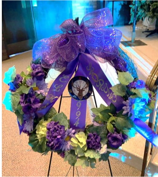
Elks Lodge 994