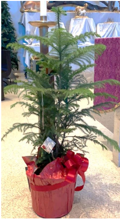
Hartel Co & Yankton Computer