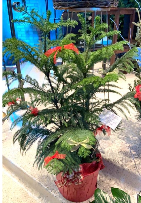
Masonry Components & Crew