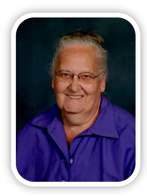
The Twenty-third Psalm

The Lord is my shepherd, I shall not want