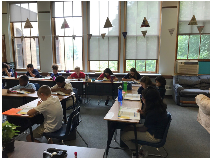
7-8 Classroom focusing hard and starting the year off strong!