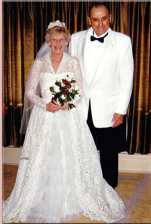
25th Wedding Anniversary