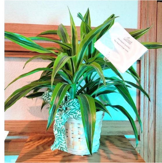
Your Newport House Family