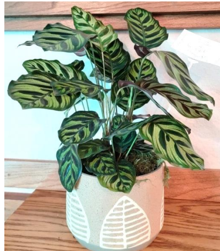
The Hancock Family