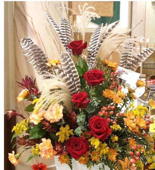
The Goeden Families