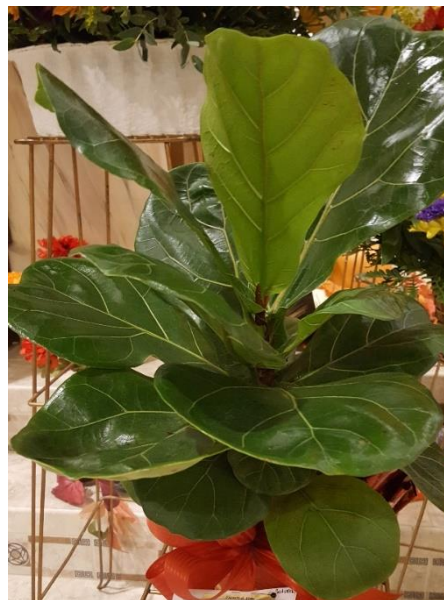
Menno Lumber Company