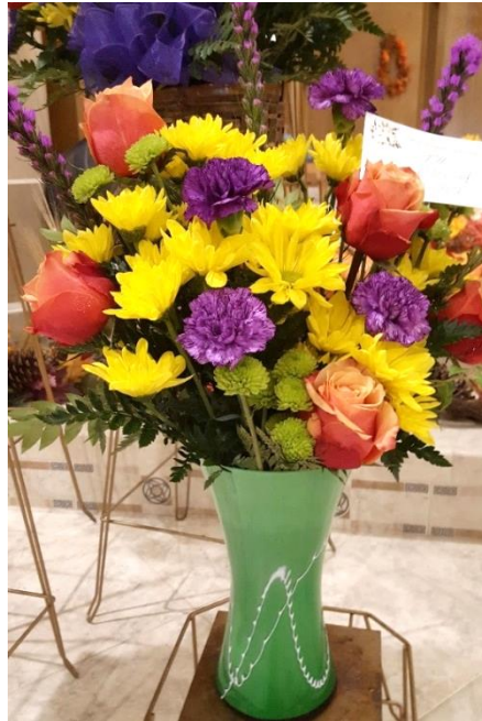
THS Class of 1988