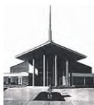
First Seventh-day Adventist Church of Tulsa

920 S. New Haven Tulsa, OK 74112-3938 Phone: (918) 834-6671