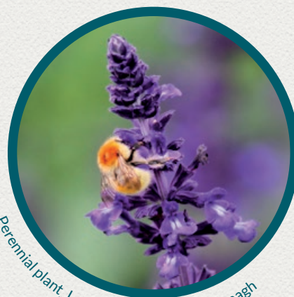
Perennial plant_Lavendar © Andrea McDonagh

www.heritagecouncil.ie/fileadmin/user_upload/Publications/Wildlife/wildlife.pdf http://beekind.bumblebeeconservation.org/