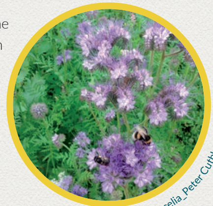
Green manure with Phacelia_Peter Cuthbert

One of the most under-used methods of soil improvement is the use of green manures (or 'cover crops'). These are plants grown specifically to be dug back into the soil to improve it. If you have an area of poor soil, particularly in urban areas this can be a good approach. Buckwheat and Phacelia are an excellent green manure. Phacelia in particular is fast growing (average 7 weeks from sowing) and provides a great food source for pollinators. After flowering, they can be dug back in to improve the soil in anticipation of perennial planting.