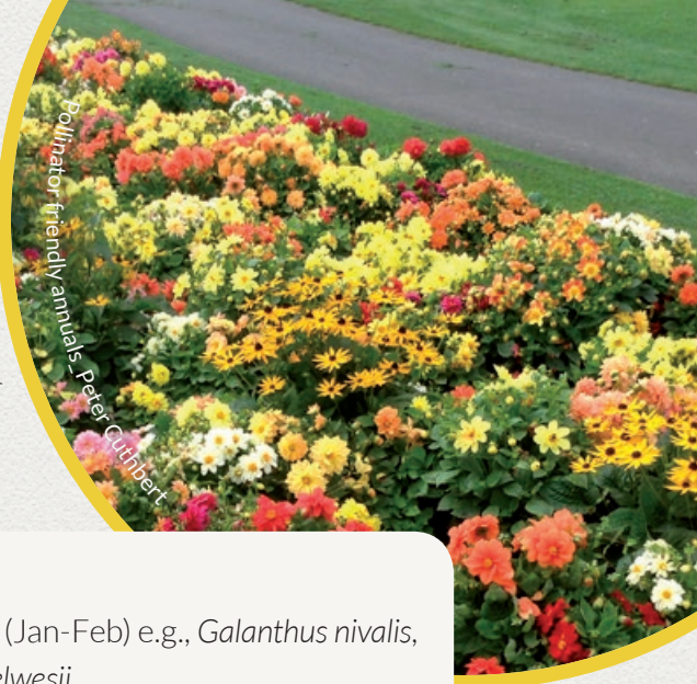
Pollinator friendly annuals - Peter Cuthbert

Daffodils or Tulips are not a good source of food for pollinators. Bees will only use Daffodils if there are no other food sources available.