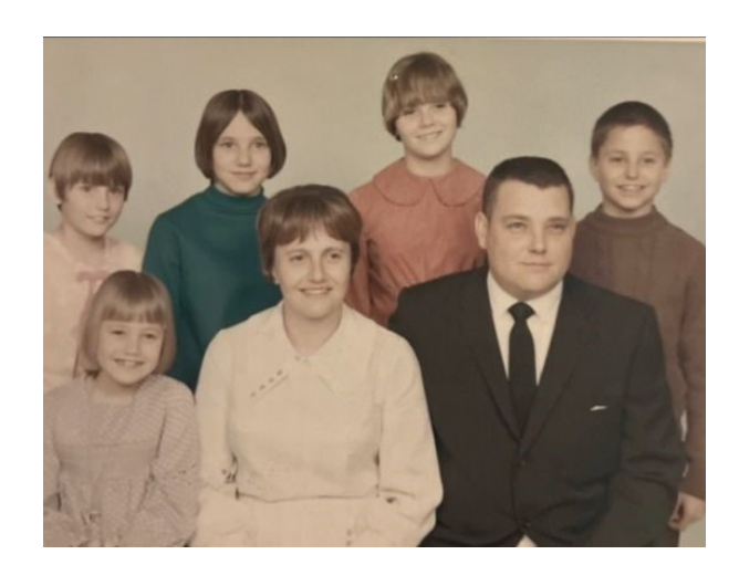
Love you always and forever-until we meet again!

The One who leaves a Legacy of love To generations that follow Has lived a life worth remembering. The One who leaves Gentle footprints On our hearts Has left a story worth telling. The One who leaves Happy memories Dancing in our thoughts Has given the gift of timeless moments Worth holding in our hearts forever.