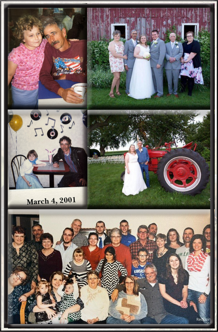
March 4, 2001

SERVICES BY K KINCANNON FUNERAL HOME & CREMATION SERVICE ALTUS • ELDORADO