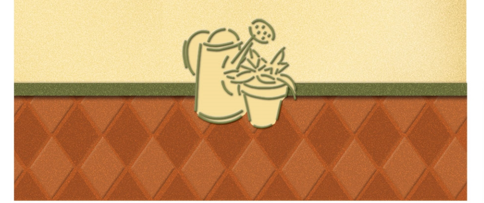
June 20, 1936 - July 2, 2023