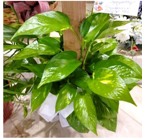
Physicians & Staff at YMC