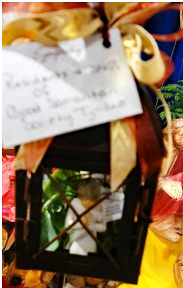
Residents & Staff of Good Samaritan Society Tyndall