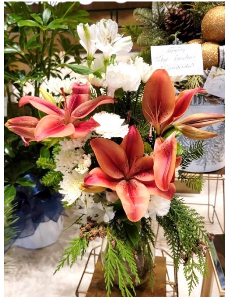
Tabor Amateur Bluebirds