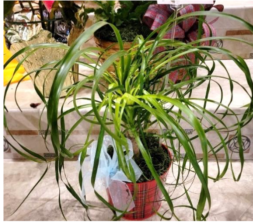
BHHS Class of 2002