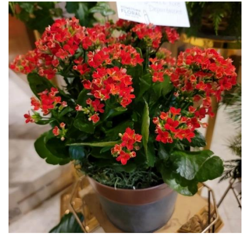
Tyndall Fire Department