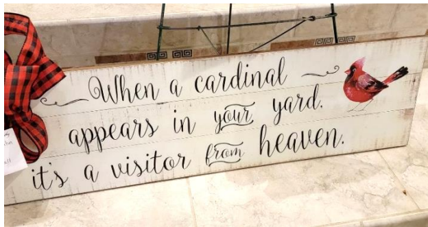
Good Samaritan Society Tyndall