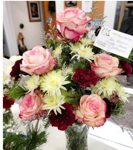
Bon Homme County Peace Officers