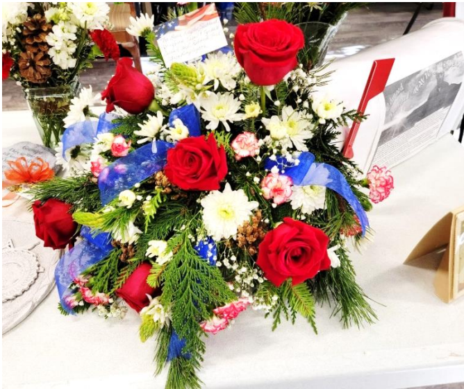
The Avon, Kaylor, Scotland, Springfield, Tabor & Tyndall Current and Retired Post Office Employees