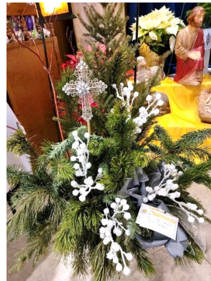
Past, Present & Future VFW Teeners