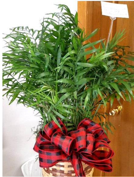
Lewis & Clark Behavioral Health