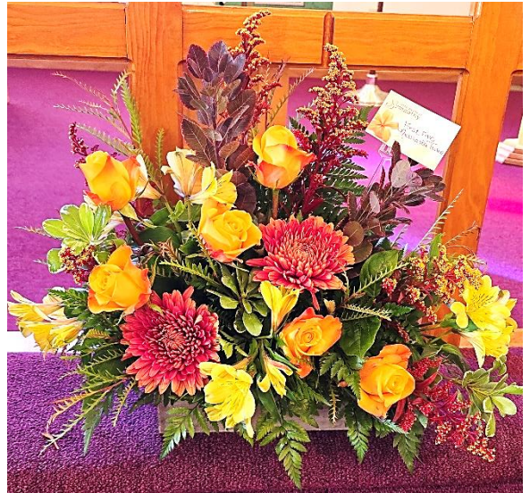
First Five Nebraska Team