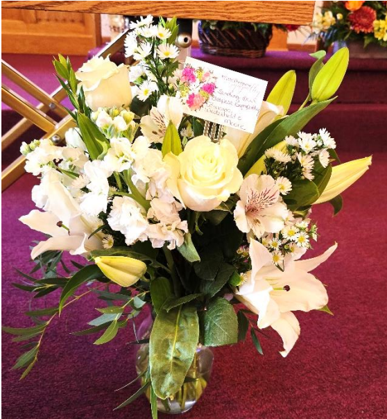
Sending our deepest sympathy, Edwards, Westerhold & Moore