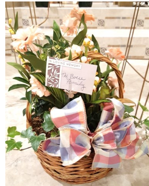
The Boese Family