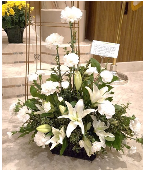
Your Schwab Family