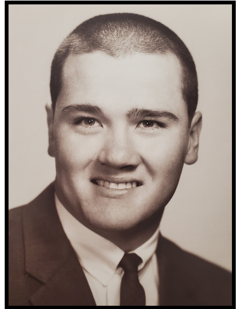
Robert Jay Whitman 1942 - 2021