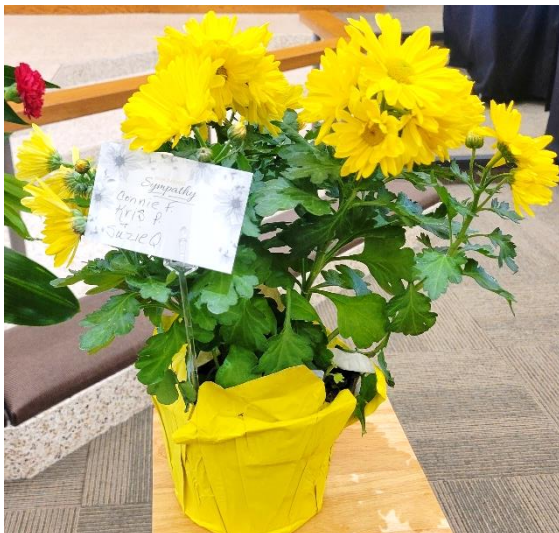
With deepest sympathy