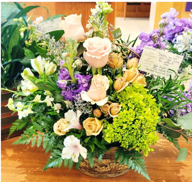
Sending you love and light during this difficult time. Your friends at Des Moines Metro Opera