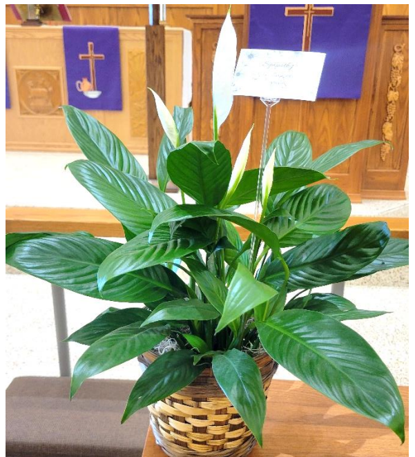
Your Avera Family