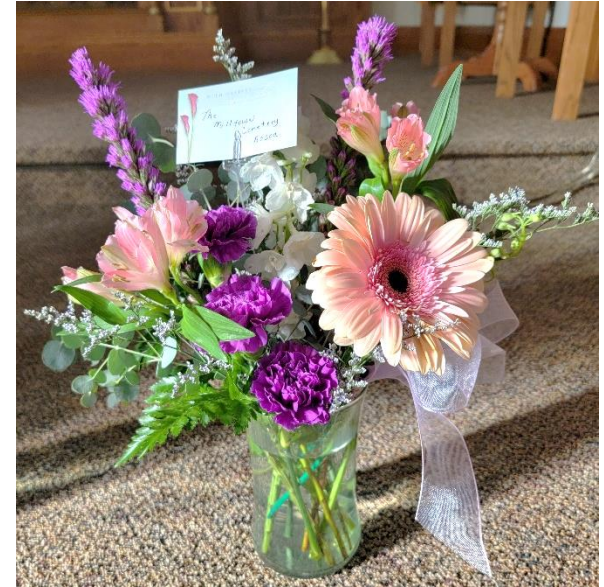
The Milltown Cemetery Association