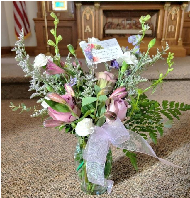
Weinberg Property Management and Heritage Square Apartments