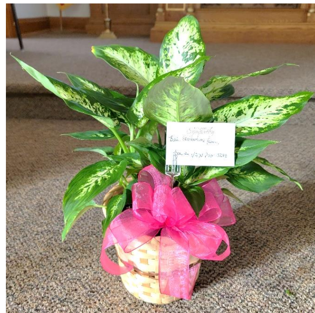
VFW Post 3298