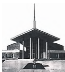
First Seventh-day Adventist Church of Tulsa

920 S. New Haven Tulsa, OK 74112-3938 Phone: (918) 834-6671