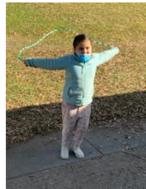
Learning how to jump rope and enjoying Hot Lunch