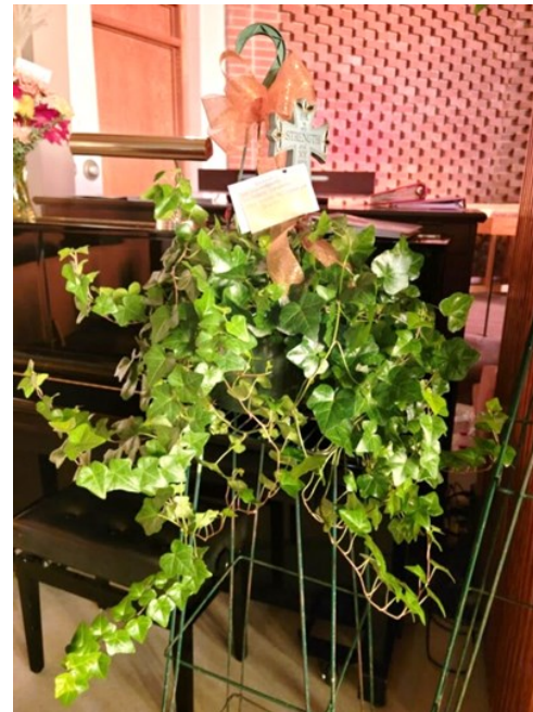
First Dakota Ag Department Yankton