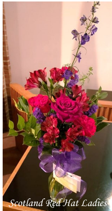
Scotland Red Hat Ladies