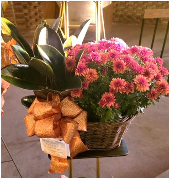
Keeping all of you in our thoughts and prayers Trappers Football Team & Coaches