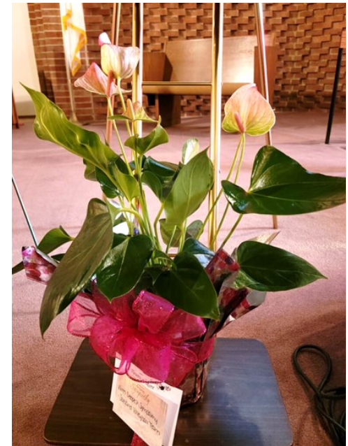
With deepest sympathy Scotland Volleyball Team