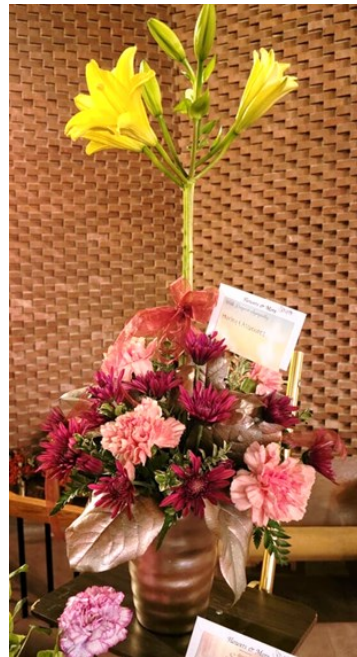
Hurley & Associates