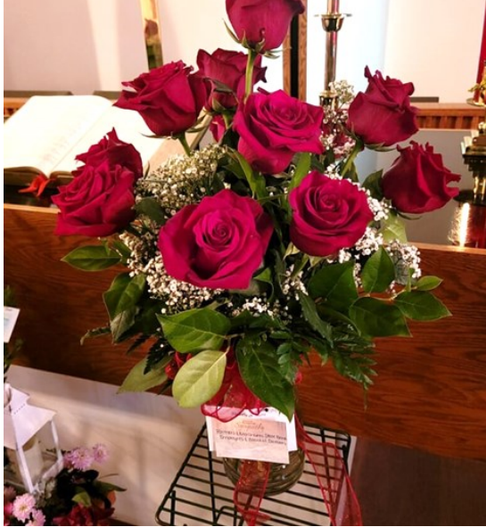
Farmers & Merchants State Bank Employees & Board of Directors