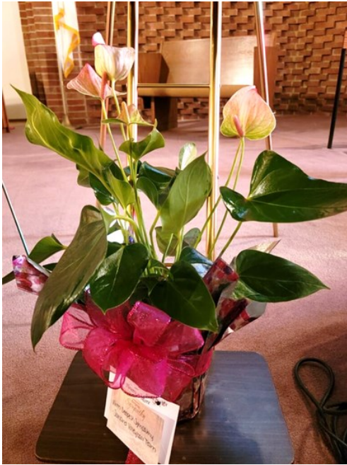
With deepest sympathy Scotland Volleyball Team