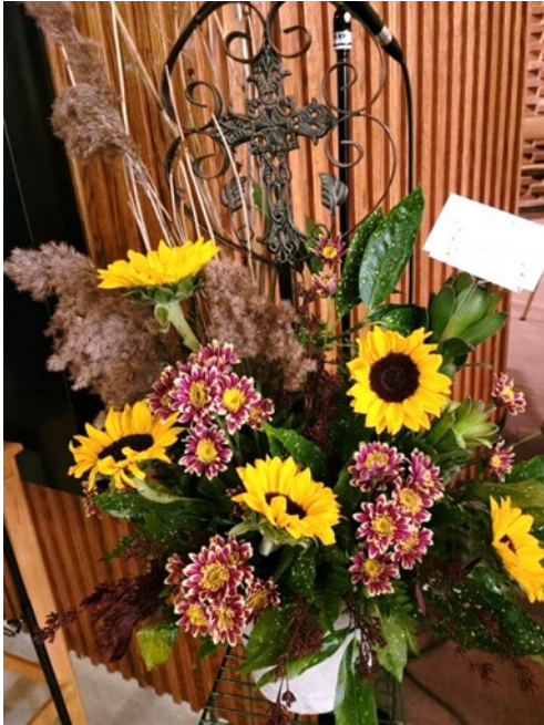
Lots of love, hugs & prayers The Roths