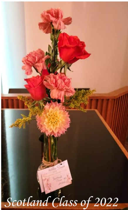
Scotland Class of 2022