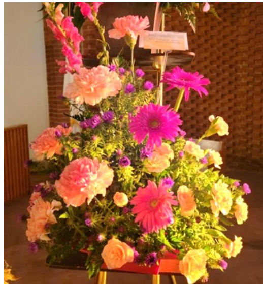
Your friends at Helena, Menno SD