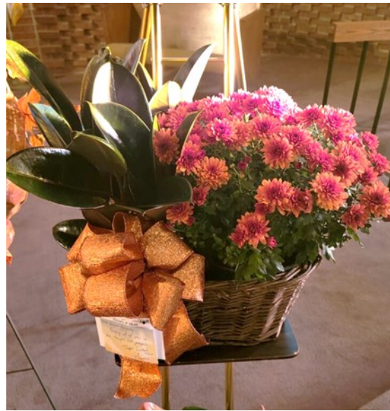
Keeping all of you in our thoughts and prayers Trappers Football Team & Coaches