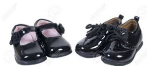
Black Shoes Quantity: 1 pair No lace if necessary