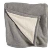
Blanket Quantity: 1 Small blanket