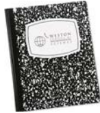
Composition Notebook Quantity: 3