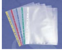
Poly Sheet Protectors Quantity: 20