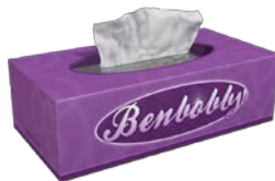
Facial Tissues Quantity: 1 box Facial tissues