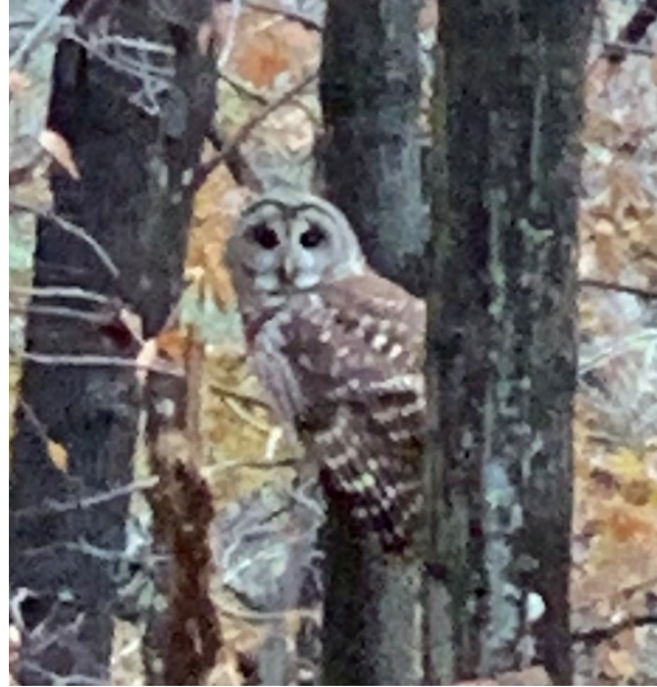
Winter Greetings to Carderock's delightful resident Mr. Whooo