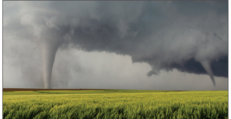
Usually a tornado is in the form of a funnel-shape. Sometimes it looks like a rope.

Wild weather comes in many forms. Tornadoes and waterspouts are directly related and look alike. Both weather events require attention because they can be dangerous to humans and animals. Wild weather is fascinating, and it is completely unpredictable sometimes!