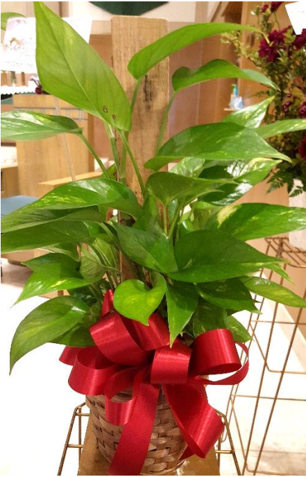
With deepest sympathy Board of Directors Administration & Employees of HEGG HEALTH CENTER