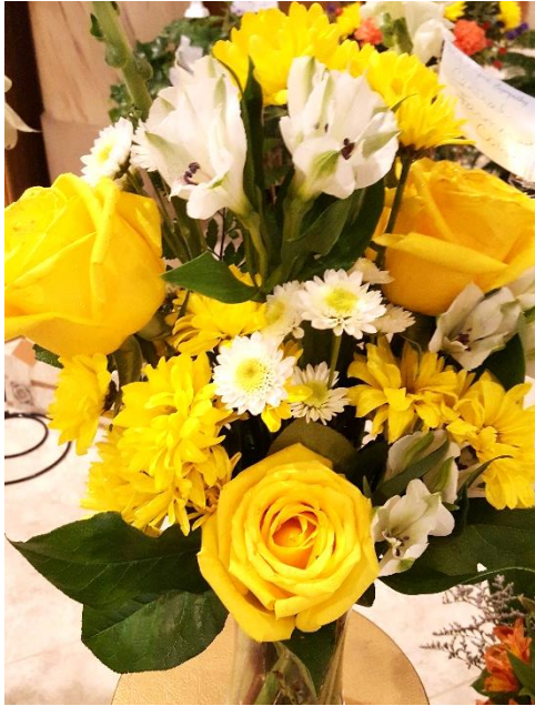
Central Farmers Coop