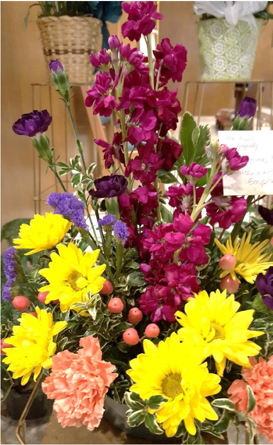
Bon Homme County Commissioners & Employees