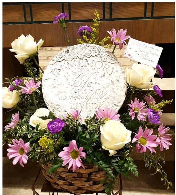
Bon Homme County Leaders and Members