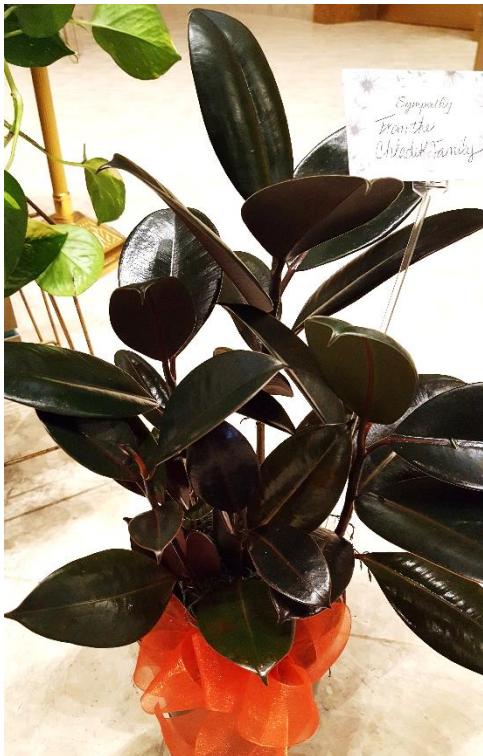
From the Chladek Family