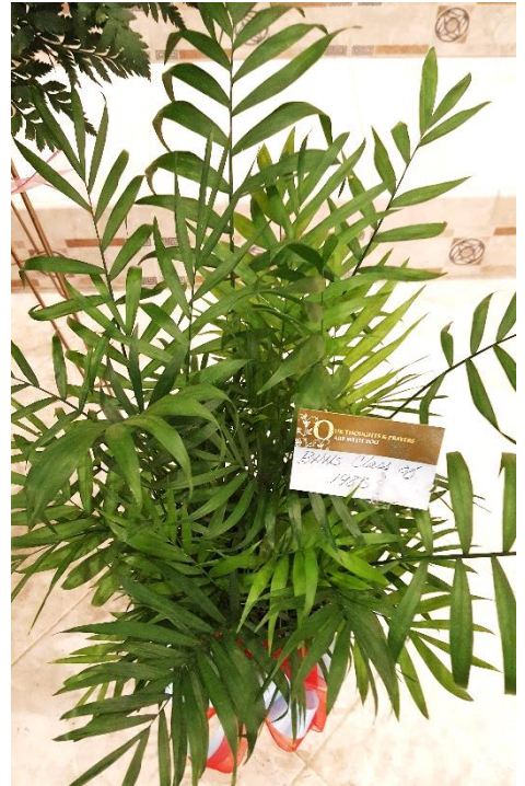
BHHS Class of 1983