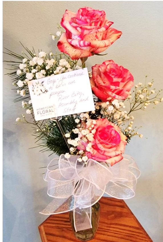
River City Assembly & Staff