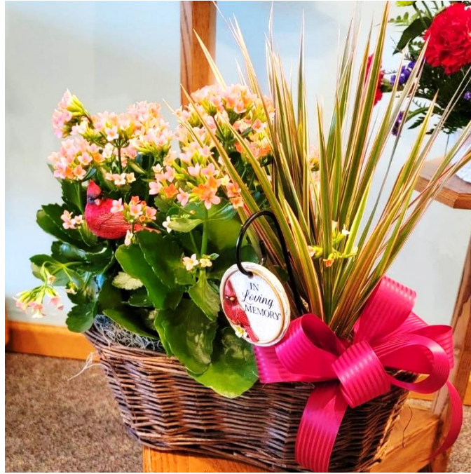
Your Walmart Family