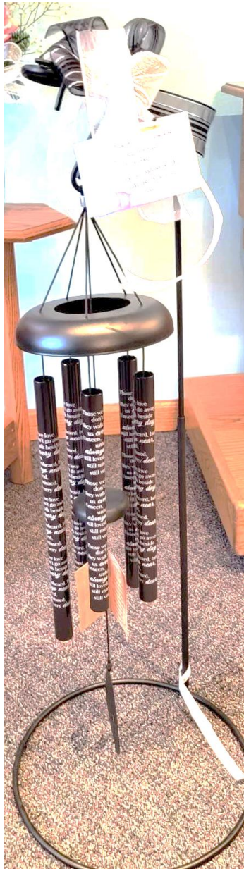
Scotland High School Freshman Class