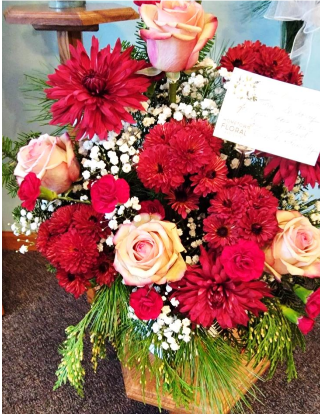
Your GSS Scotland Friends & Family