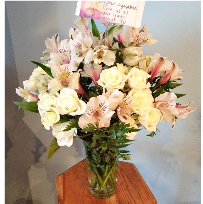
Your friends, Class of '90