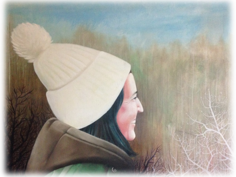
Born to Life on Earth September 29, 1941 Frazee Minnesota