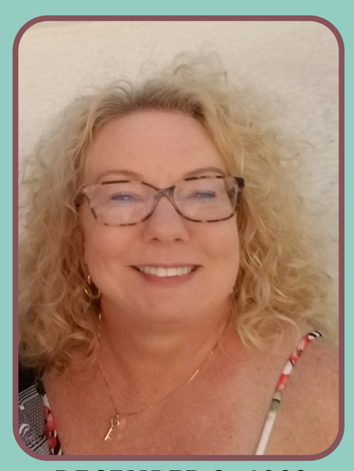
DECEMBER 3, 1966 -JUNE 24, 2023