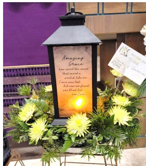
Tyndall Chamber of Commerce