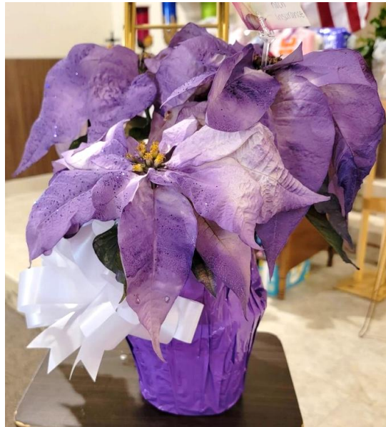
Staff at Koch Insurance