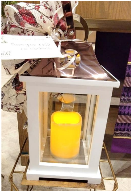
Your FMH Co-workers