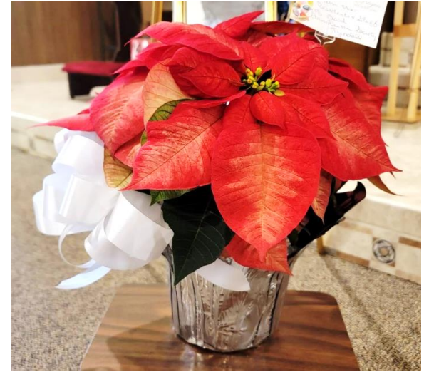
Residents & Staff of Good Samaritan Society, Tyndall