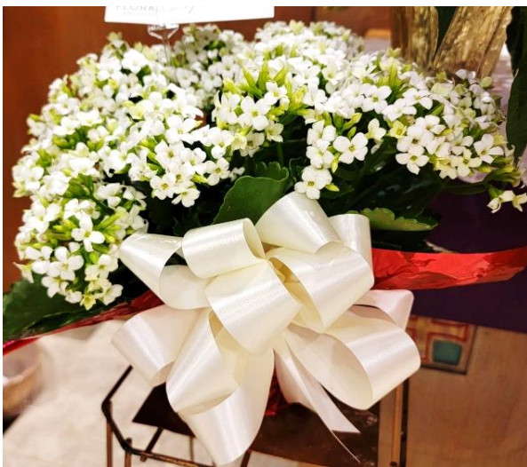
Tyndall Fire Department