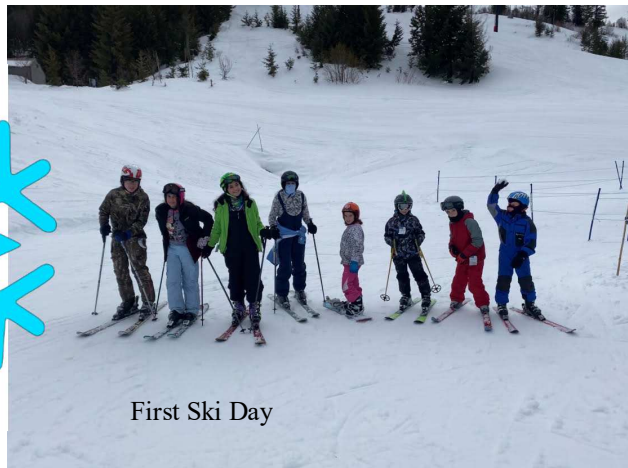
First Ski Day