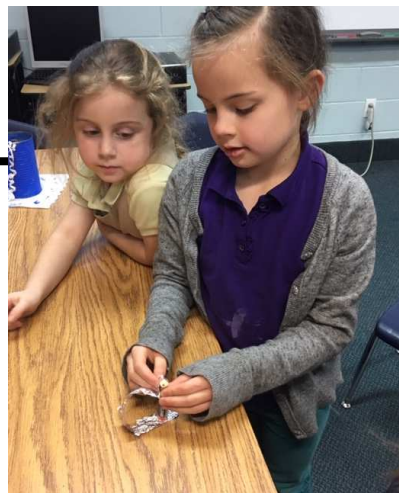
Making circuits with a light bulb...