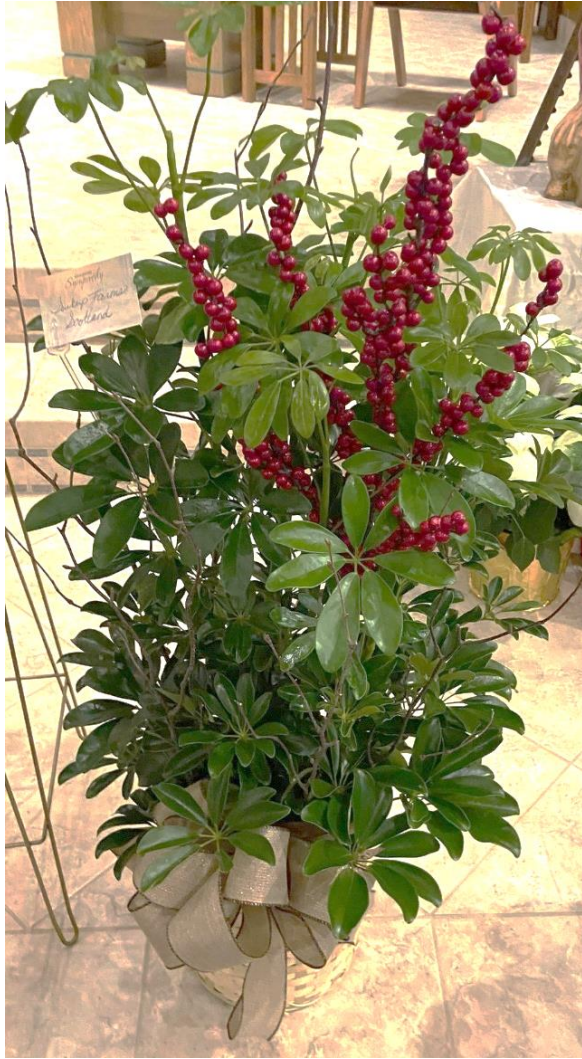
Soukup Farms, Scotland