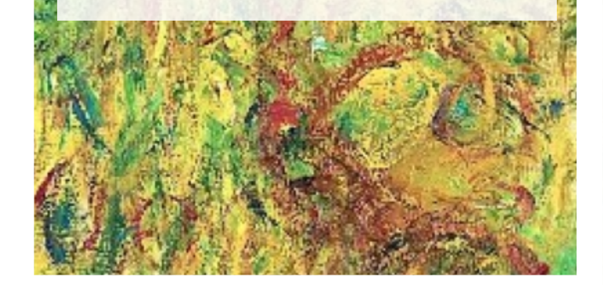
June 5, 1962 - June 5, 2023