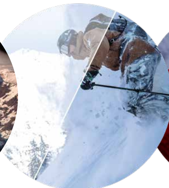
ENGINEERED FOR FIRN AND FRESH SNOW