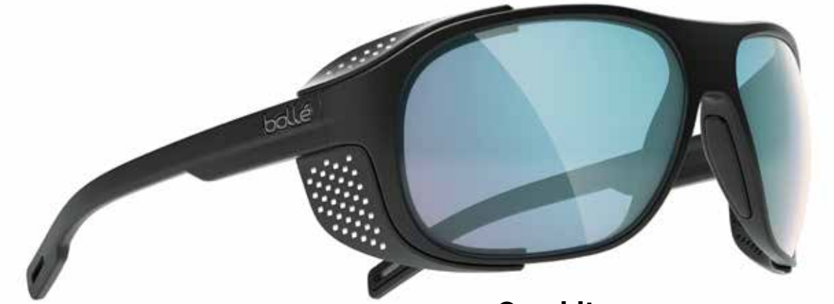
Graphite RRP from $110 to $200