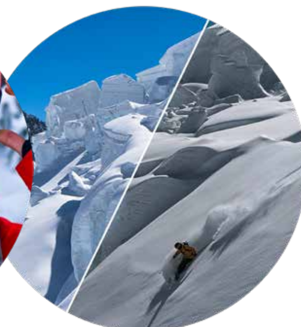
TECHNOLOGY FROM COLOR DEFICIENCY LENS