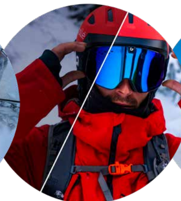
30% COLOR ENHANCEMENT TWICE BETTER THAN THE CLOSEST COMPETITOR (15%)