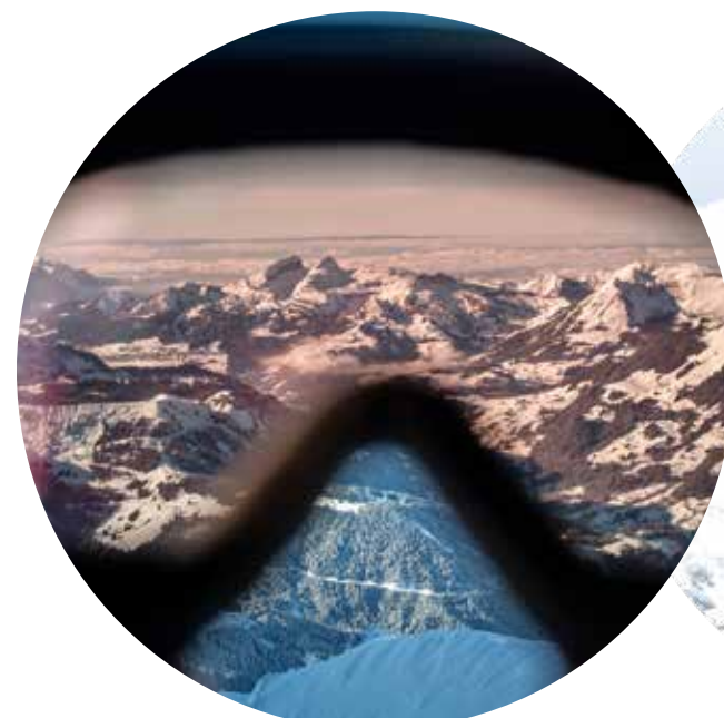
INCREASE DEPTH PERCEPTION