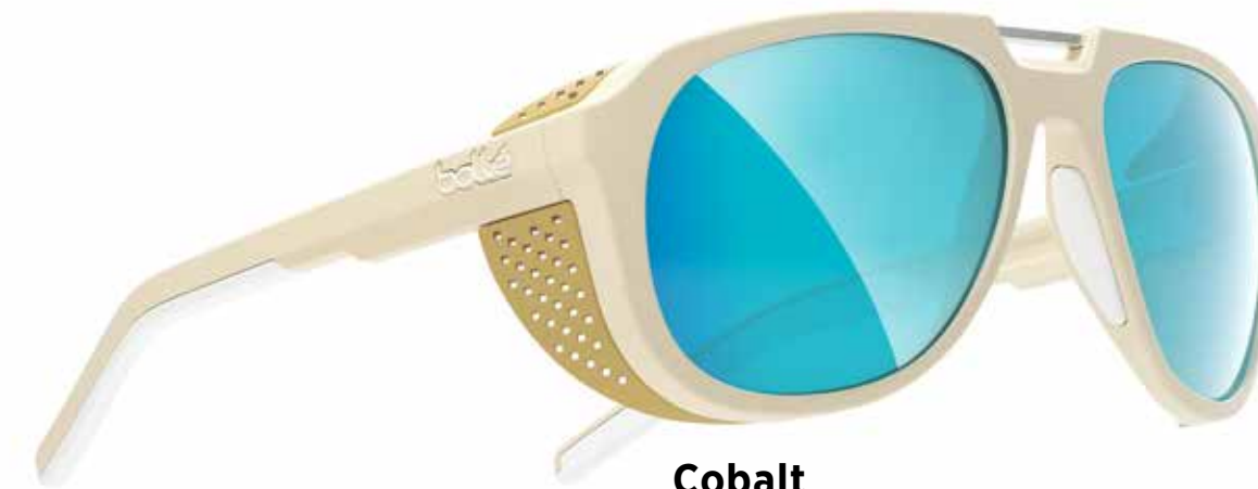
Cobalt RRP from $110 to $200