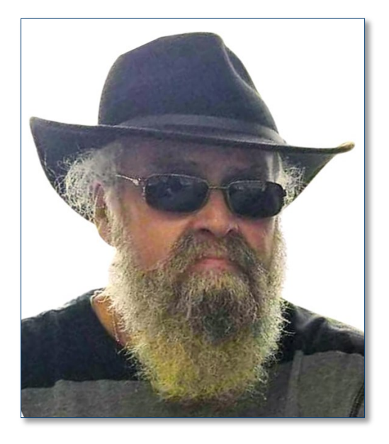
October 3, 1953 - December 27, 2023