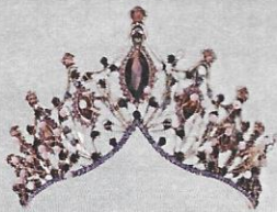
LAST BREATH November 21, 2022