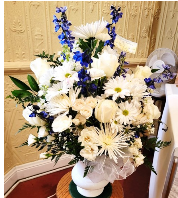
The DeLand Family