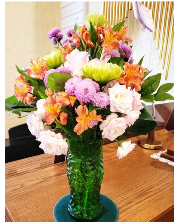
North Central Heart Physicians & Staff