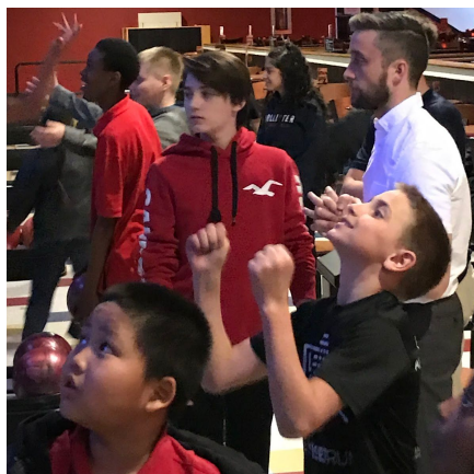
Elementary on their reading minutes bowling field trip.