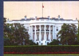
Surviving the Election