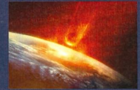
Plagues and Promises

Register and watch at answersinprophecy.com